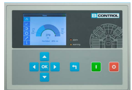
The new display of the B-CONTROL MICRO

Behind-the-scenes control operations have also seen significant improvements. The B-CONTROL MICRO now shares key features with its 'big brother' B-CONTROL II,