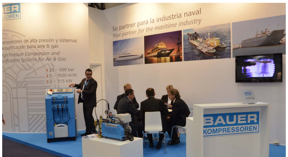
BAUER staff in an in-depth customer meeting