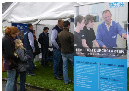
"Understanding High-Pressure Technology" was the motto at BAUER's learning station.

Today, lifelong learning is essential and natural given the rapid pace of technological change. And the annual Lernfest ('learning festival'), a celebration of learning held at Benediktbeuern Monastery, proves that learning can be fun. The Lernfest is a blend of education and entertainment, offering