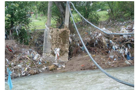
Widespread damage resulted from the worst flooding to hit the Balkans in 120 years

The staff collected enough donations to more than fill a large van, organised by the campaign; the van was packed to the roof before setting off for the crisis-struck region, and the donations that would not fit into the van were welcomed by charity collection points for the victims of the disaster.