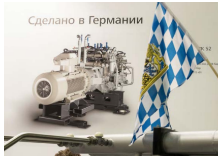
Made in Germany: quality under the Bavarian flag: the new BK 52 compressor block

The Who's Who of the global oil and gas industry came together in Moscow at the end of May. The BAUER stand was staffed by an international team from Russia, Italy and Germany. A tour of the exhibi-