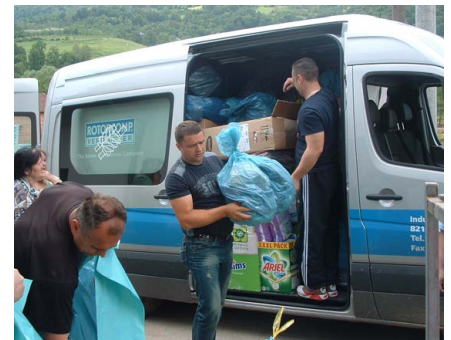
Full up! BAUER's donations team pack goods into the crammed BAUER van.

staff had already set up an initiative to collect donations of food, clothes and other items. The company management supported the campaign with a will, making a generous financial donation as well as providing assistance with logistics.