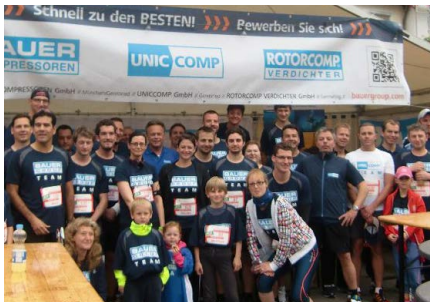
The BAUER running team lines up for a photo after the prize-giving ceremony