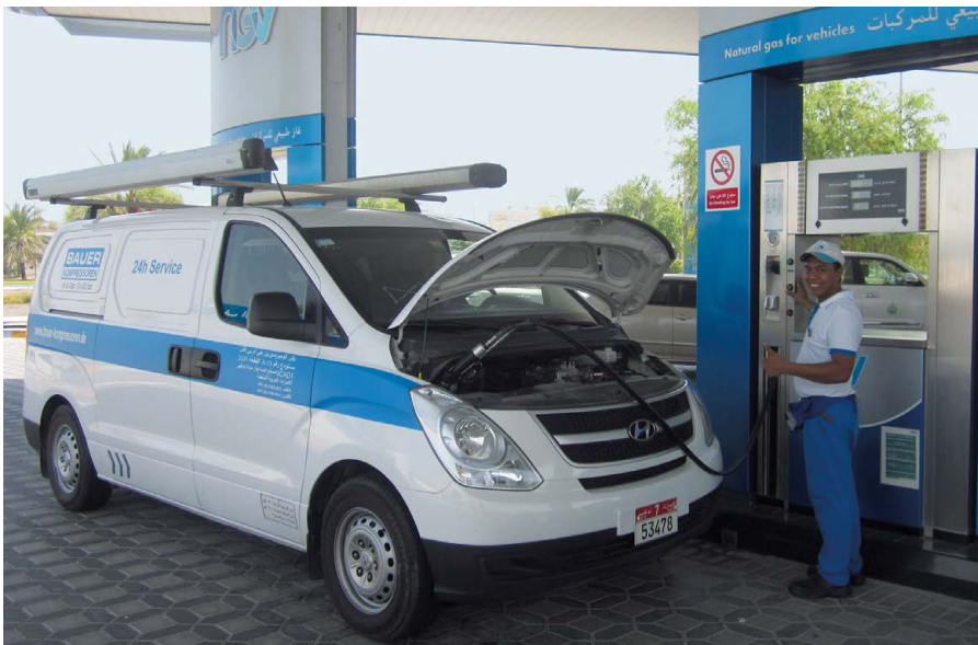
Premiere in Abu Dhabi: The first gas-powered van fills up at BAUER's CNG refuelling station

When compressed natural gas from a BAUER KOMPRESSOREN refuelling station first pours into the storage tank of the company van, pride spreads across the driver's face. The van is the first of five CNG-powered vehicles to join the BAUER company fleet in the United Arab Emirates (UAE).